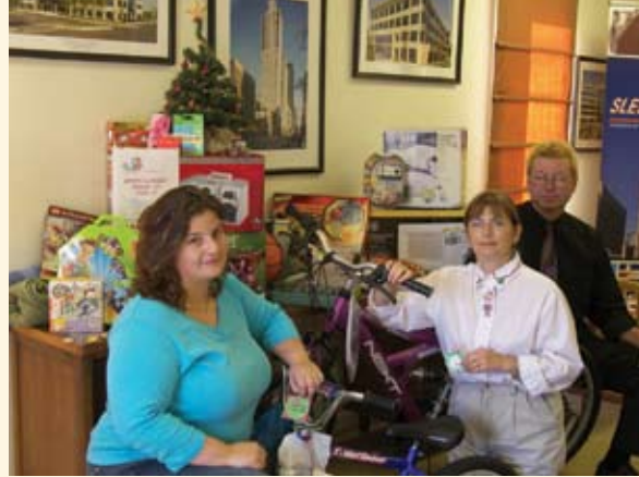
SMC Sponsored Adopt a Family Program

Smith-Midland® Corporation plays an active role in its local community in Fauquier County. Donations are made to various local non-profit organizations, including the Midland Christian Academy.