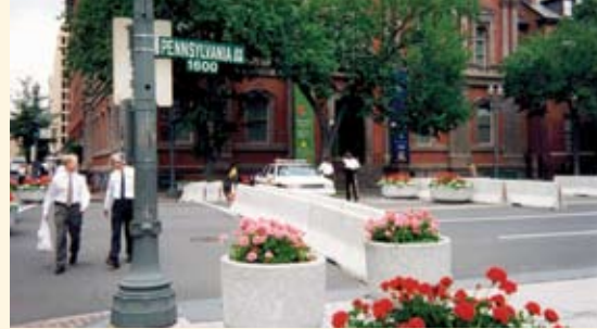
J-J Hooks® on Pennsylvania Ave; Washington, DC